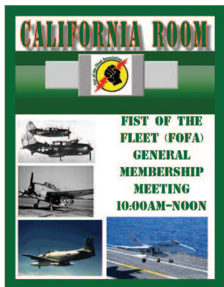
Holiday Inn Bayside assists navigation with personalized reunion signage.

Holiday Inn Bayside has all the offerings important for reunion planners, budget pricing, discounts, complimentary hospitality room and welcome reception, personalized signage to navigate the property, free parking (very difficult to find), and shuttles to the airport, Amtrak and local shopping/attractions. There are catering options and affordable menus.