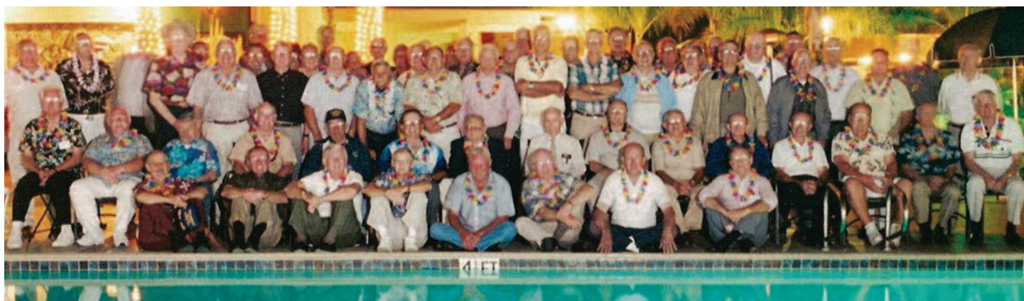
The USS Shields members by the Holiday Inn Bayside's pool. They have enjoyed six reunions at this location.

BARTELL HOTELS... SAN DIEGO'S UNFORGETTABLE LOCATIONS