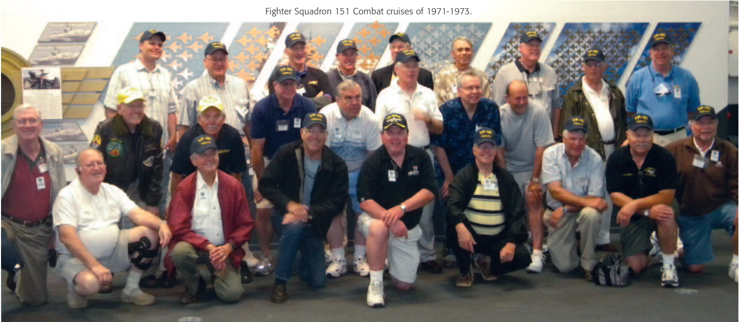
Fighter Squadron 151 Combat cruises of 1971-1973.

REUNION news Between magazine issues, sign up for our monthly eblast. Send request and email to editor@reunionsmag.com .